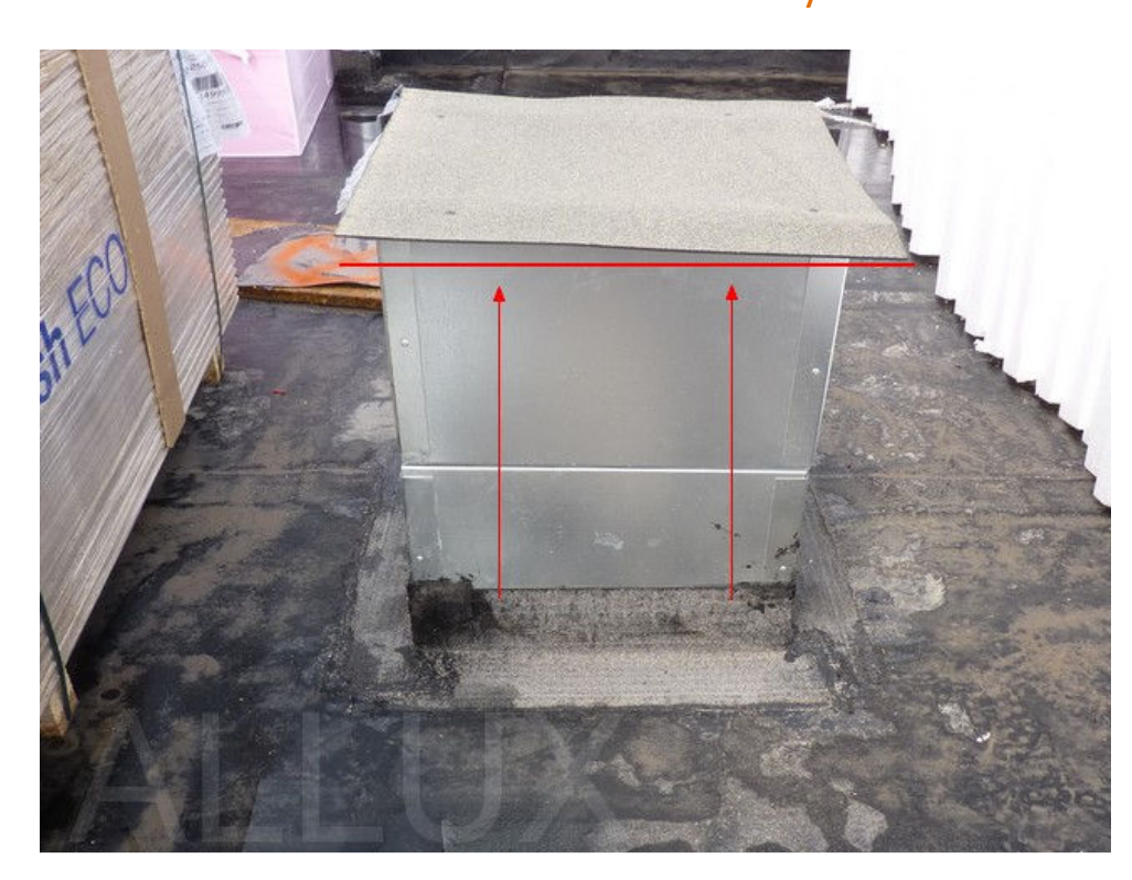
Pull the steamproof film on the external side of the base as high as possible to the top edge of the base.